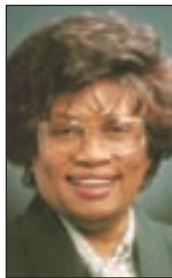
Dr. M. Joycelyn Elders

Dr. M. Joycelyn Elders is a United Methodist and a pediatrician who served as the U.S. Surgeon General of Public Health Service in 1993 under President Bill Clinton. She was the first African American to serve in the position. Dr. Elders argued the case for universal health coverage and was a spokesperson for President Clinton's health care reform effort. She was a strong advocate for comprehensive health education, including sex education in schools.